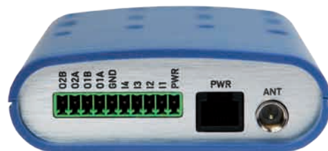
Back view • inputs/outputs • power • antenna