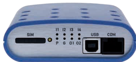
Front view • SIM • LED • USB-B • RS232