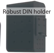
Version in plastic housing