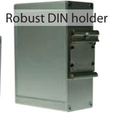
Version SL - metal housing