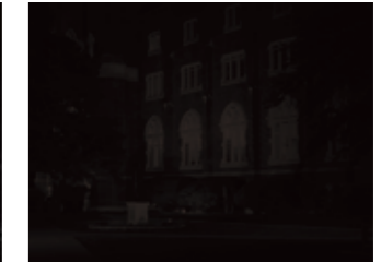
Without IR Light